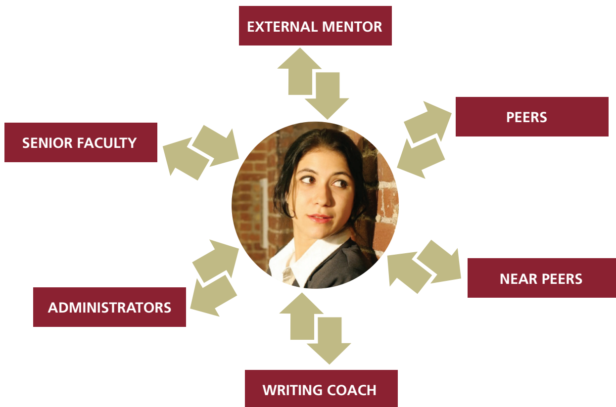
Figure 2 Mutual Mentoring Model