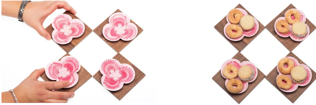
Figure 4 - Pyaha Collection: Canastitos