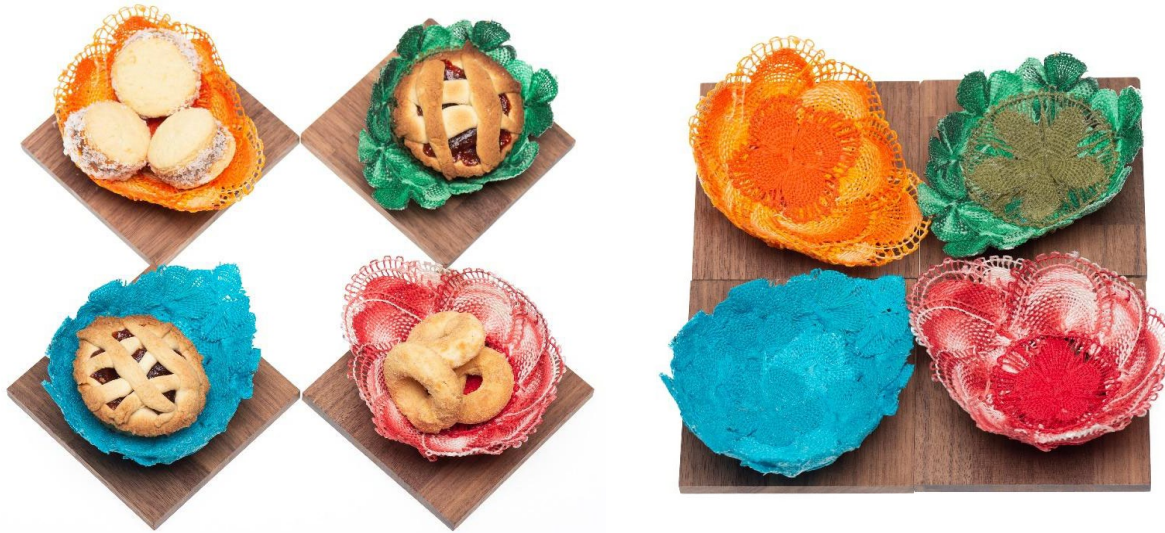
Figure 3 - Pyaha Collection: Arasá, Photos by Author

lace has been starched and formed over 3D-printed forms to create and maintain their shape. This process is both food-safe and water-resistant, allowing the dishes to be cleaned & reused.