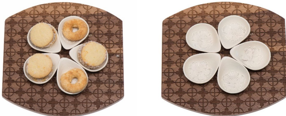
Figure 5 - Pyaha Collection: Nicho

The Nicho platter and bowls successfully explore the arasá (guava flower) and nicho (bird's nest) motifs using newer production technologies. The bowls were cast and then pressed with arasá ñanduti to capture the radiating floral pattern in the porcelain. Due to project time constraints, the flameworked glass underlay in the nicho pattern was simulated through 3D modeling and laser cut acrylic. For the wooden platter, the nicho pattern was digitized, put into repeat, and laser engraved. In production, this could continue to be laser engraved wage hand carved by woodworking artisans.