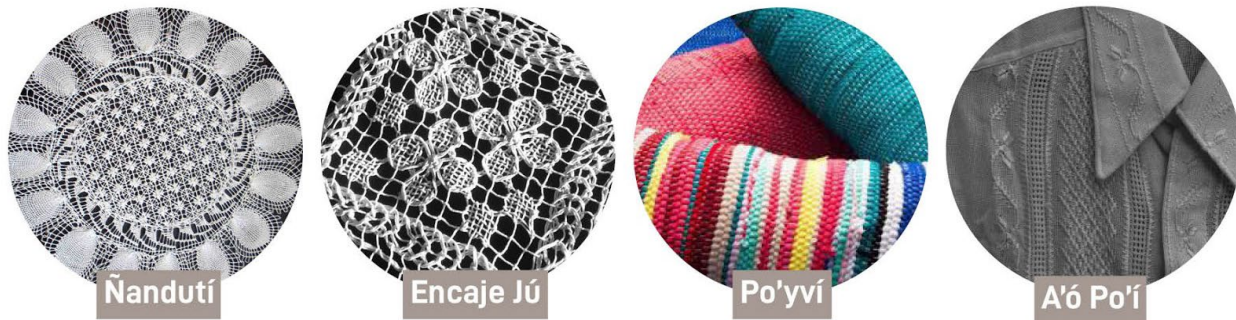
Figure 1 - Ñandutí & Encaje jú; Po'yví; A'ó po'í

All of these textiles exhibit natural motifs, many of which are extremely recognizable and meaningful to the Paraguayan people, including arasá (guava fruit flower) and nicho (bird's nest).