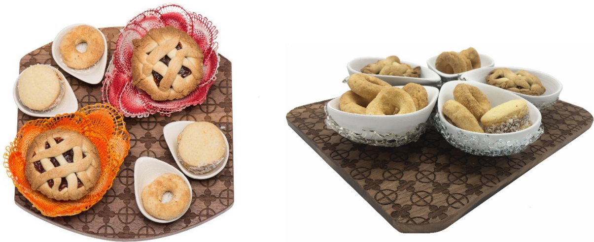
Figure 6 - The versatility and arrangement possibilities of the Pyaha Collection