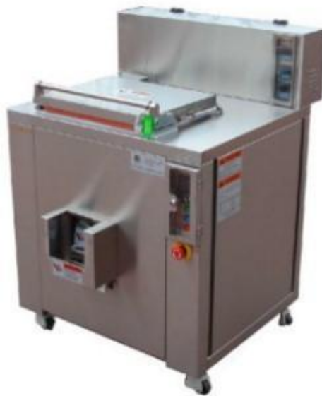
Figure 2. Ecovim-66 system.

We determined the major opportunities for end markets and performed a detailed literature review to ascertain how the Ecovim-66 output material could be used, based on key characteristics needed. For each potential end market use, we defined “optimal” ranges of key parameters. For example, feed for dairy cows requires carbohydrate and protein levels to be within a certain range. Using the data collected by Dairy One, the characteristics of the output materials were compared to these ranges to determine if the dehydrated food was a potential match for that end market. Qualitative information was also included in the analysis where appropriate. Though food safety would be an important requirement in utilizing the dehydrated material in animal feed markets, analysis specifically related to food safety was outside the scope of this assessment.