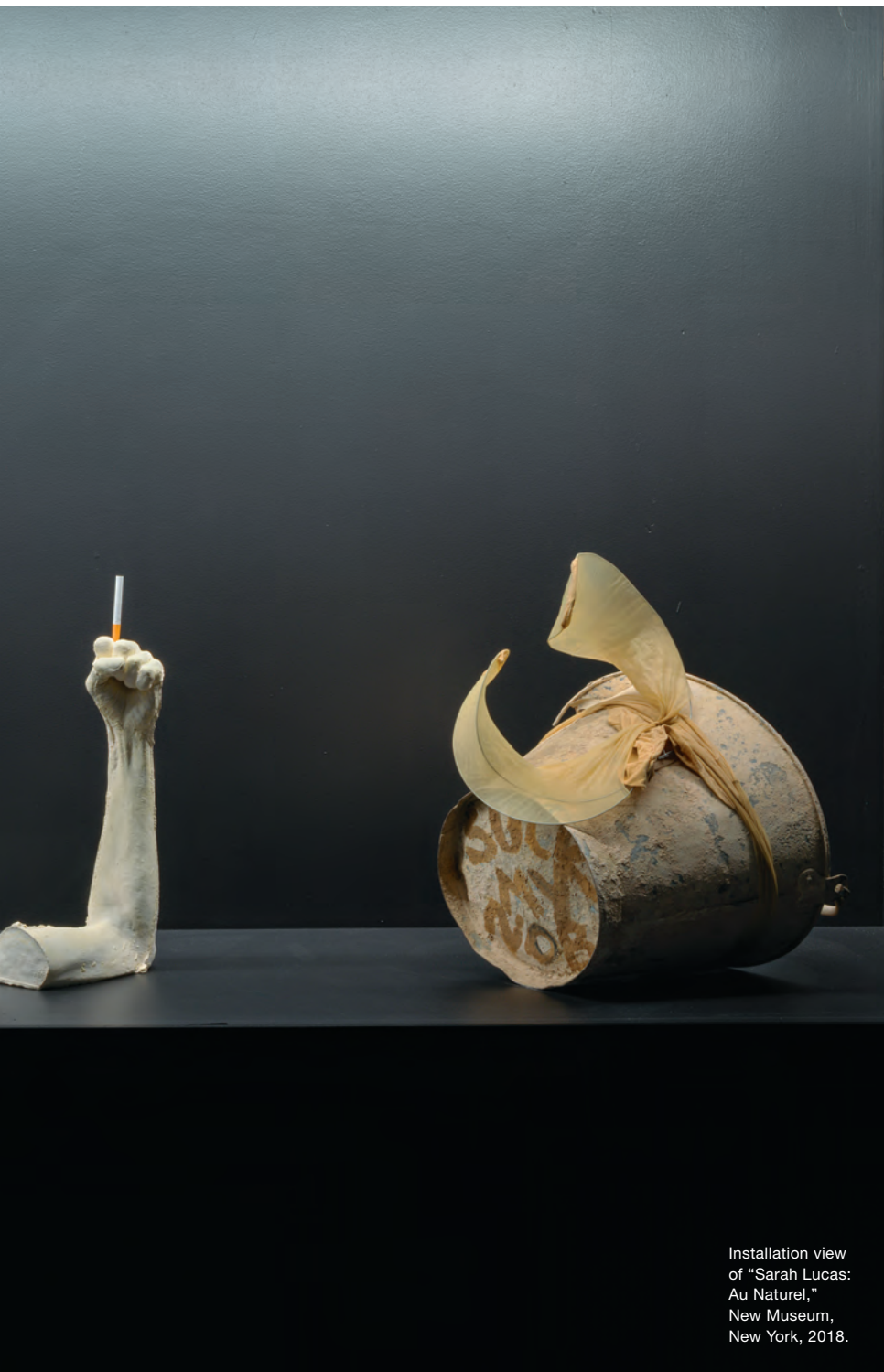
Installation view of "Sarah Lucas: Au Naturel," New Museum, New York, 2018.

for Lucas's interventions. She has looked around—what ambitious artist has not?—and borrows or takes what she can use. What is important is what she does with her sources, and why she does it. Lucas has built a coherent and highly idiosyncratic body of work with a specific look, tone, feel, and content, despite the range within her oeuvre. The contemporary art scene would be a much poorer place without her input.