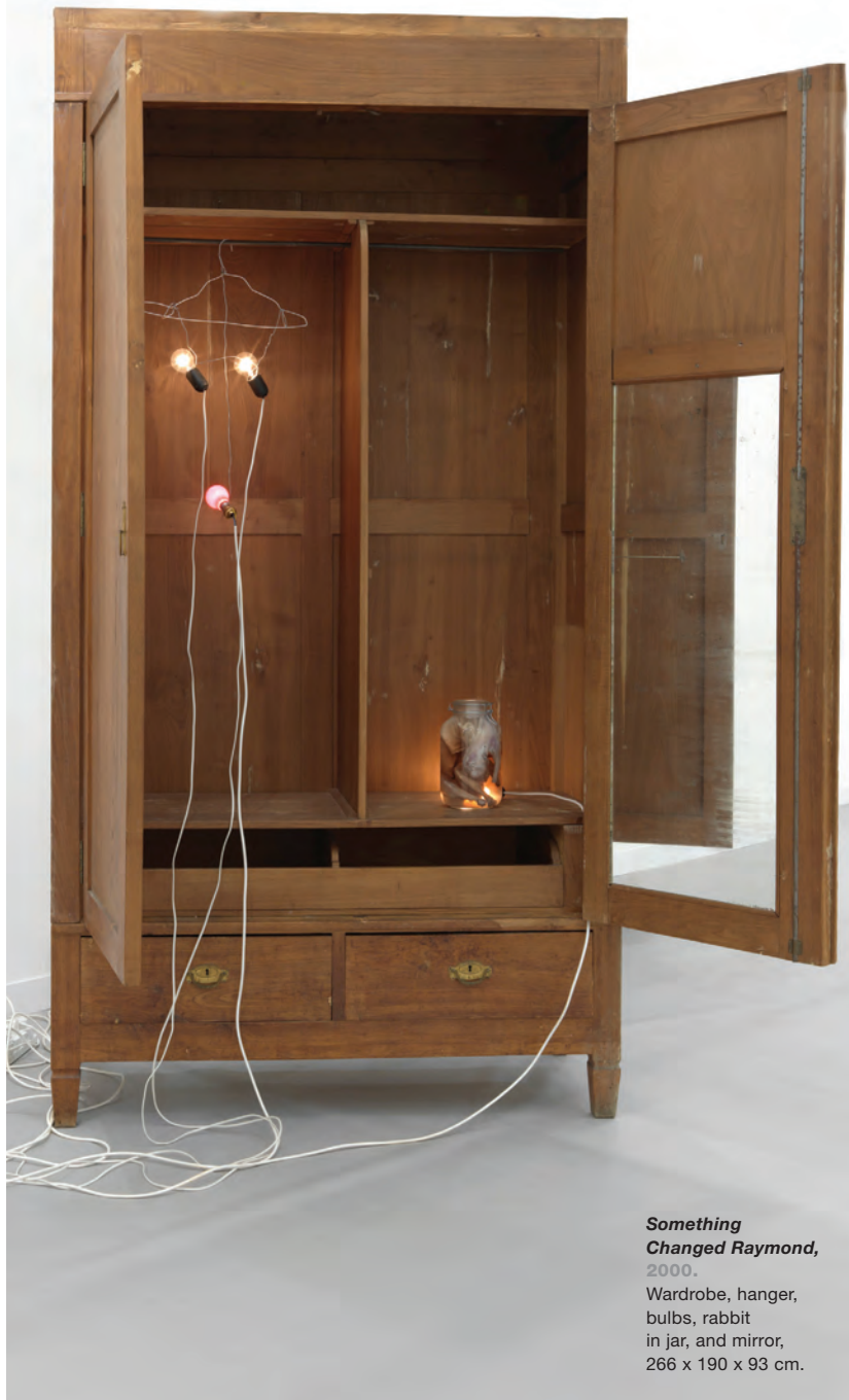
Something Changed Raymond, 2000.

Wardrobe, hanger, bulbs, rabbit in jar, and mirror, 266 x 190 x 93 cm.