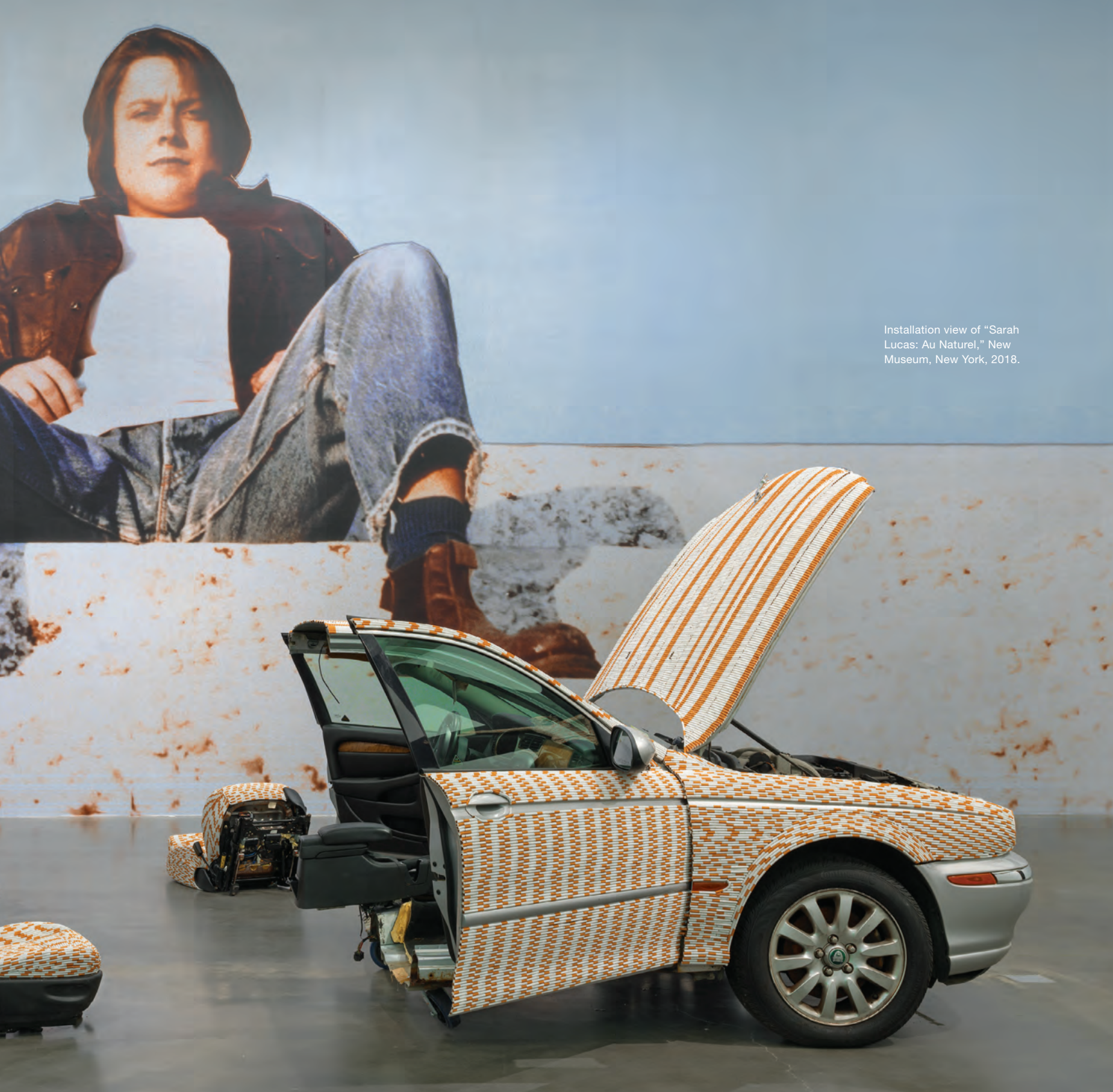
Installation view of "Sarah Lucas: Au Naturel," New Museum, New York, 2018.