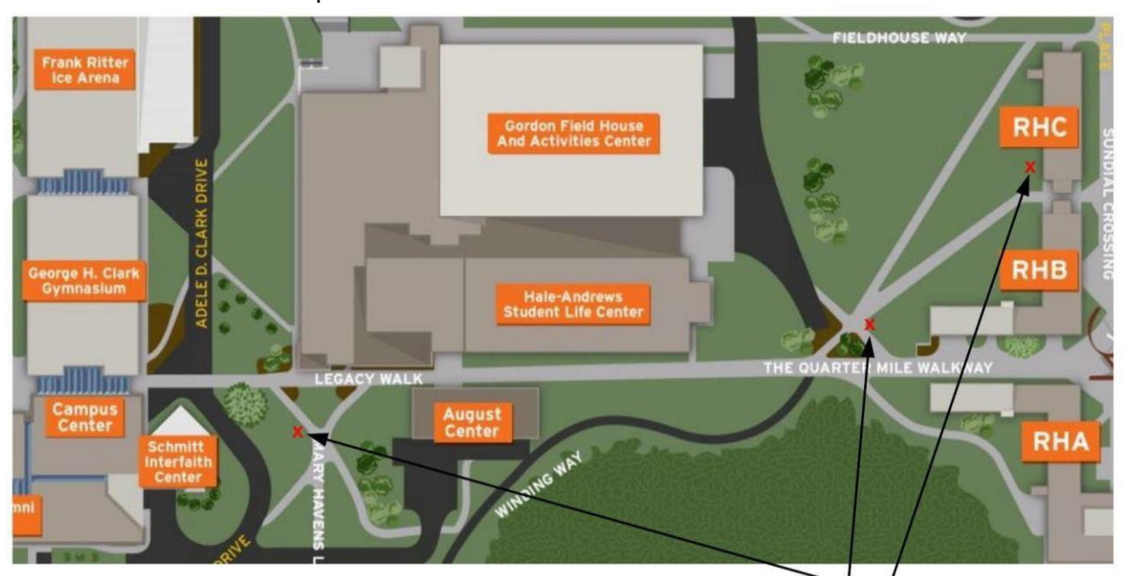
Locations of the paintable rocks

The location of the official paintable rocks are marked with red Xs below: